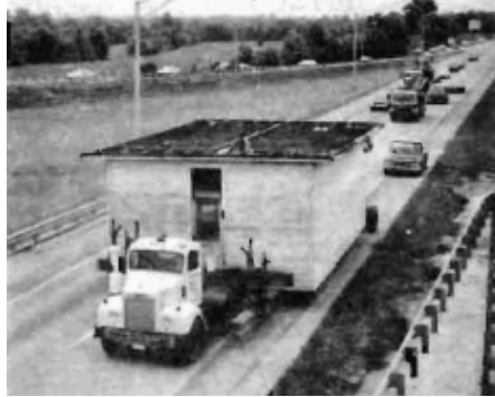
Rosenwald Schoolhouse being moved from Pleasant Ridge to Yellow Creek Park.

Preservation: Provided grant to Downtown Owensboro, Inc. to hire an architectural historian to place the Main Street Historic District on the National Register. Salvaged pieces of the historic Guenther Building to be used in a public garden in future years. Purchased the Rosenwald School which was in danger of being demolished and developed plans to move it to Yellow Creek Park and restore it for public use. Received Bicentennial Grant for the renovation of the Rosenwald School and raised over $13,000 in matching money and services.