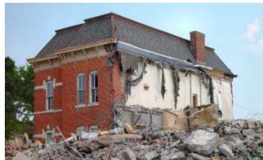
July 2003 - Old Jail under demolition

Last fall, PA and Downtown Owensboro Inc. commissioned an architectural and structural review of the Old Jail complex. PA provided $1500 for the study and a Southern Intervention Grant from the National Trust for Historic Preservation provided an additional $1000. The study report was published on February 18, 2002, and is online at www.iompc.org/documents/OldJail/ . ■