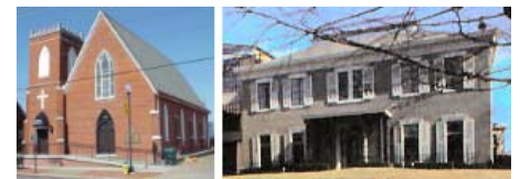
Old Trinity Centre John Hampden Smith wing

Theatre Workshop of Owensboro's slate roof repaired: Last year, TWO spent $5,900 to repair the Old Trinity Centre's slate roof, supported by a grant of $3,000 from Preservation Alliance. PA's offer, made in 2003, stipulated that the building be registered as a local historic landmark under the review authority of the Owensboro Historic Preservation Board, which oversees preservation of local historic districts and landmarks.