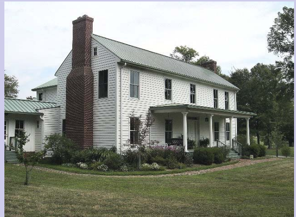
Beech Hill (orig. 1832) today, after 2002 renovation / addition