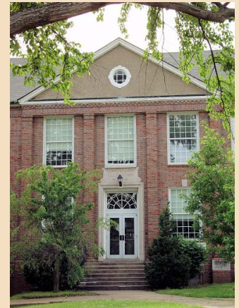
Longfellow School, erected 1931