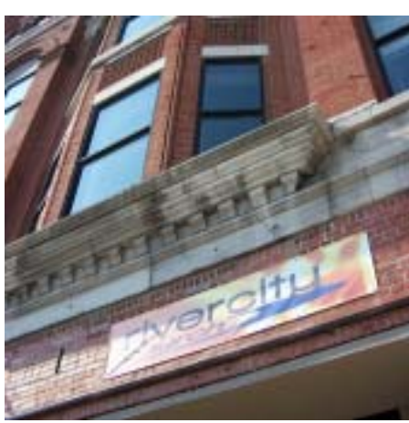
River City Church now in the Bates Building

The soiree will be something different for PA, which typically has held luncheon meetings. Please join us for a fun evening. ■