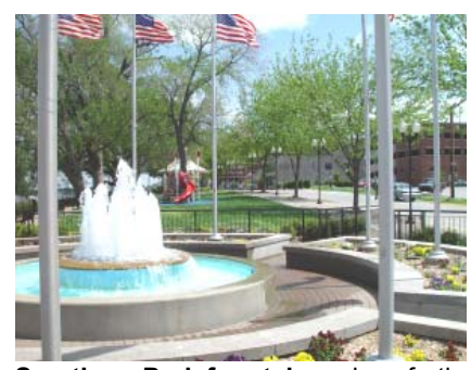
Smothers Park fountain springs forth