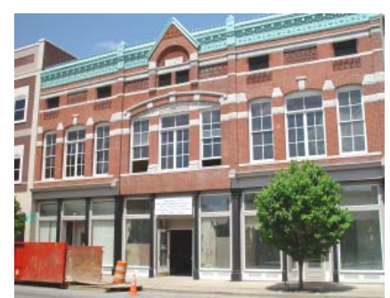
Owensboro Symphony Orchestra's future Performing Arts Academy in the Miller Building, under rehab at River-Park Center