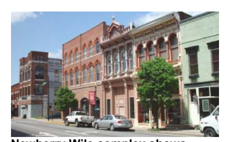
Newberry Wile complex shows Historic Main Street looking great!