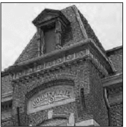
Second Empire cupola of Old County Jail

The city wants to implement the Waterfront Plan, and has asked the county to donate the jail to the city rather than sell it to a private individual.