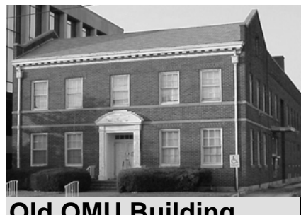
Old OMU Building

Even though a promotional video produced by OPD emphasized the ugly interior of the old complex, those could be redone more tastefully. The Harreld and adjoining buildings still have useful life in them and could be adapted for one or more organizations smaller than OPD while maintaining the character of downtown.