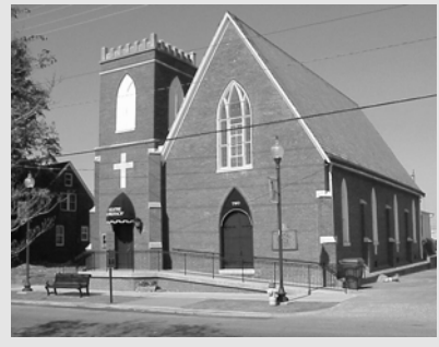
Theatre Workshop of Owensboro

Theatre Workshop of Owensboro is now performing in the renovated Old Trinity Centre. Last year the city deeded the old church building to TWO, which raised funds to revive their traditional performance hall.