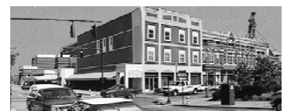
RiverPark Center shows old and new buildings can work together

◆ FALL DAY TRIP to French Lick Springs & West Baden Springs Resorts in Indiana