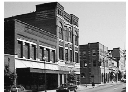
Peachtree & Bates are important to pattern of historic façades along 2nd St. district