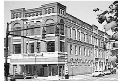
Bates Building at NW corner 2nd & Allen sts.

cc: Mayor of Owensboro, City Commissioners, City Manager Daviess County Judge/Executive, County Commissioners, Deputy Judge/Executive