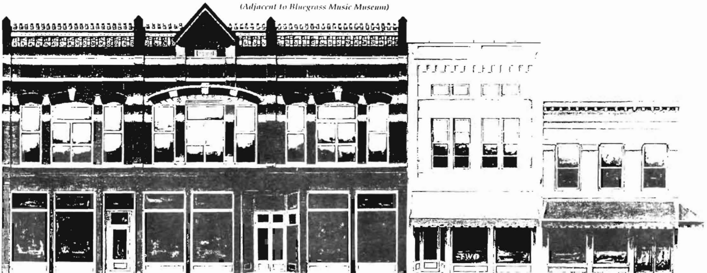
Proposed Main Street Restoration (Adjacent to Bluegrass Music Museum)