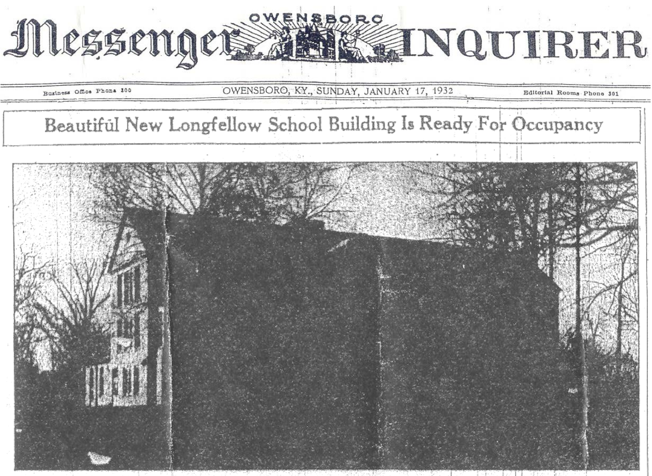
This is a picture of the new Longfellow grade school in South Frederica streat, which is ready fur occupancy.