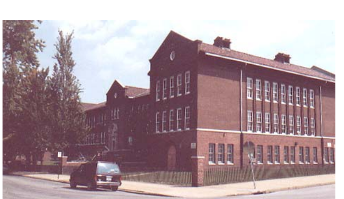
Sigel School, Allen Ave., St. Louis, 1906