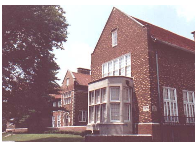
Meramec Elementary, Meramec St., St. Louis, 1910

- Photos source: <u>www.builtstlouis.net</u>.