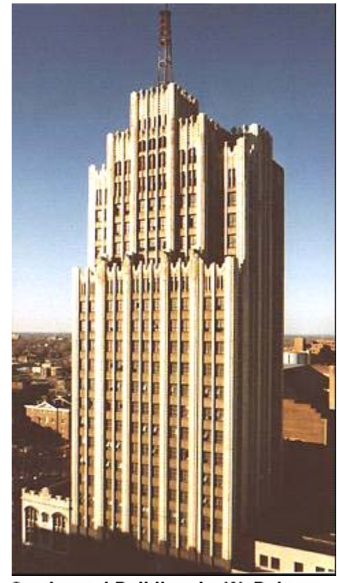
Continental Building, by W. B. Ittner